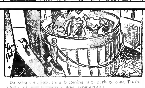
Do keep your yard from becoming huge garbage cans. Trash-filled yards tend to disassociate communities.