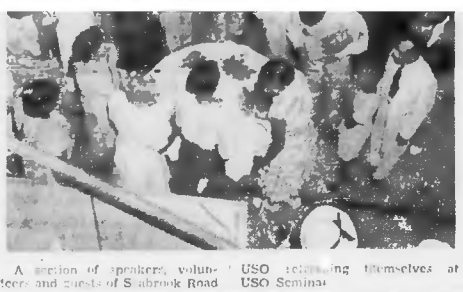
A section of speakers, volunteers and guests of Seabrook Road USO receiving themselves at graduation.