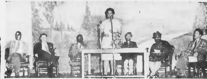
Speakers at first session... Seabrook Road USO Seminar...