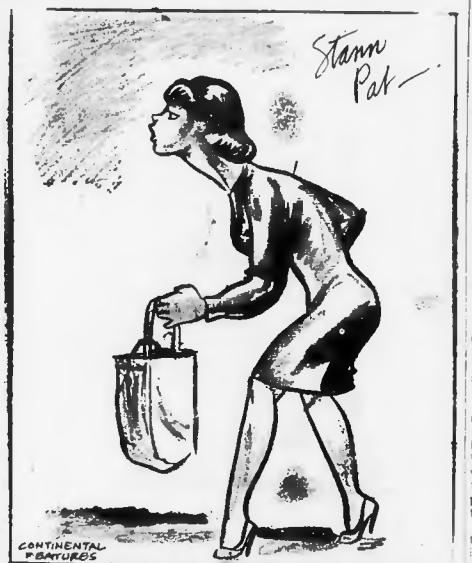
Stoop to conquer isn't the slogan when social success is concerned. Do assume good posture — it makes you look better and feel better.

An assorted and motley array of young hoodlums were rounded up by hard working members of the police juvenile bureau, detail and social workers, who are making a study of the problem. The assortment was herded into one of the local high school auditoriums and then the big surprise was sprung. These little gang members were treated to a $40 array of talent brought to the school by the police as an "example" exhibition of what good boys can hope to be.