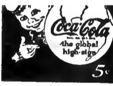
CAPITAL COCA-COLA BOTTLING CO. 315 W. Morgan St.

SEE YOUR LOCAL AGENT BANKERS FIRE INS. CO. DURHAM, N. C.