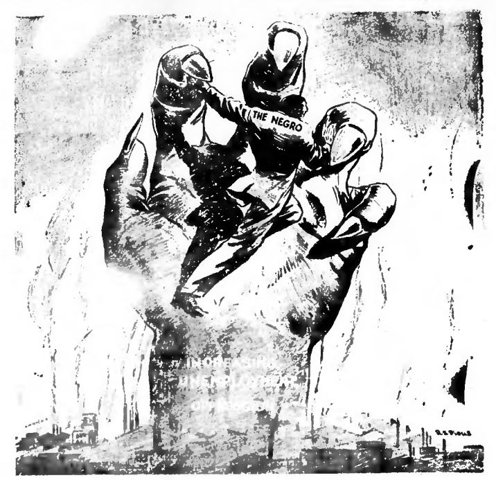
"The crushing monster is active again!"

We, by our sufferings, learn to prize our bliss.