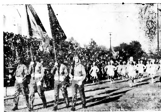
Shown above are the high-stepping Majorettes of the Agricultural and Technical college of North Carolina at Greensboro as they added color to Astor Homecoming game Saturday recently, against the West Virginia State college Yellow Jackets of Institute, West Virginia.

A new liquid poison, especially fatal to rats and other rodents has been discovered. It is also a powerful poison for humans and will not be released for the present, says the USDA. It is called 10-80.