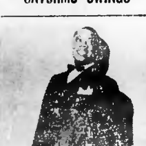
Louis Armstrong (above) with his celebrated orchestra is playing to capacity crowds in Columbus, Ohio...