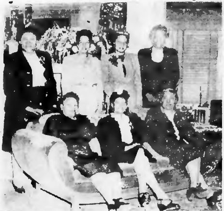
Below are shown members of the Executive Committee of the Women's Auxiliary of the Old North State Medical and Pharmaceutical Society...