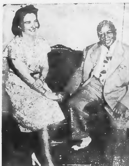
FATHER DIVINE AND HIS NEWLY WEDDED WIFE