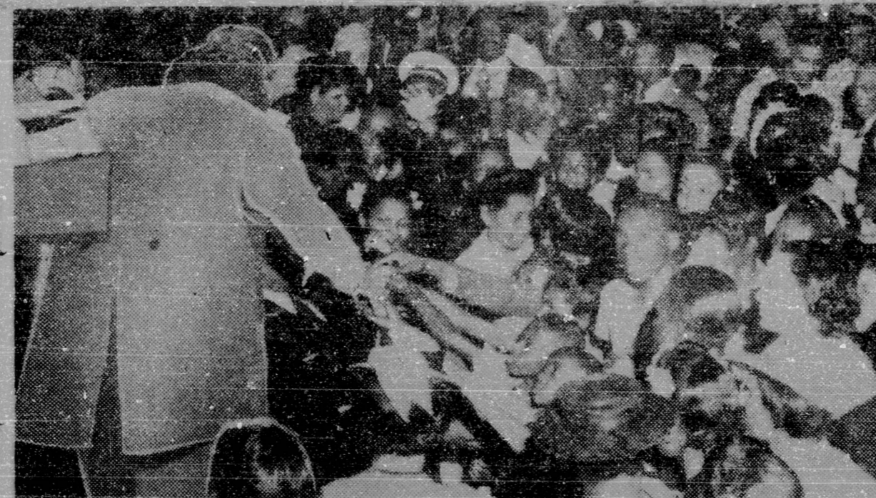
Bishop "Daddy" Grace shaking the hands of the 332 joiners during the 21st annual services of the House of Prayer at the Golden Gate Auditorium, New York City. It was said that Daddy Grace was the first man to jam the Auditorium, more than 50,000 people, during the weeks' service. The bishop stated, "The eyes of the people are becoming wide open to the gospel throughout the world."