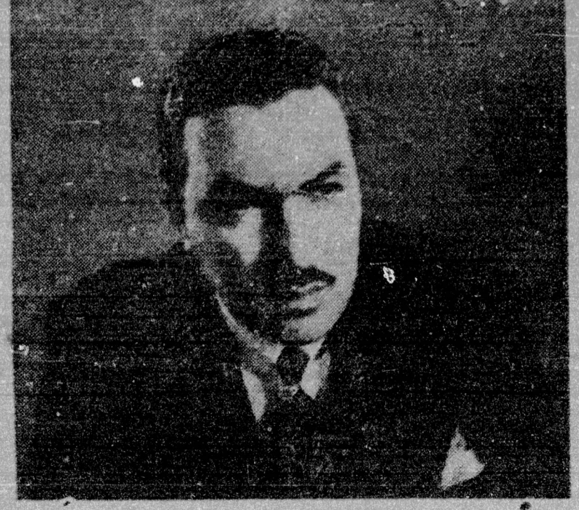
Congressman Adam Clayton Powell militant foe of the KKK and the southern white supremacists will challenge the Klan on its home grounds when he appears at the Southern Youth Legislature in Columbia, S. C., on October 19.

WASHINGTON, D. C. (ANPA)—The Navy Department last Friday discredited a report that a sick 19-year-old colored sailor had been beaten with a club at the Jacksonville Naval Air station and refused permission for two days to enter the sick bay.