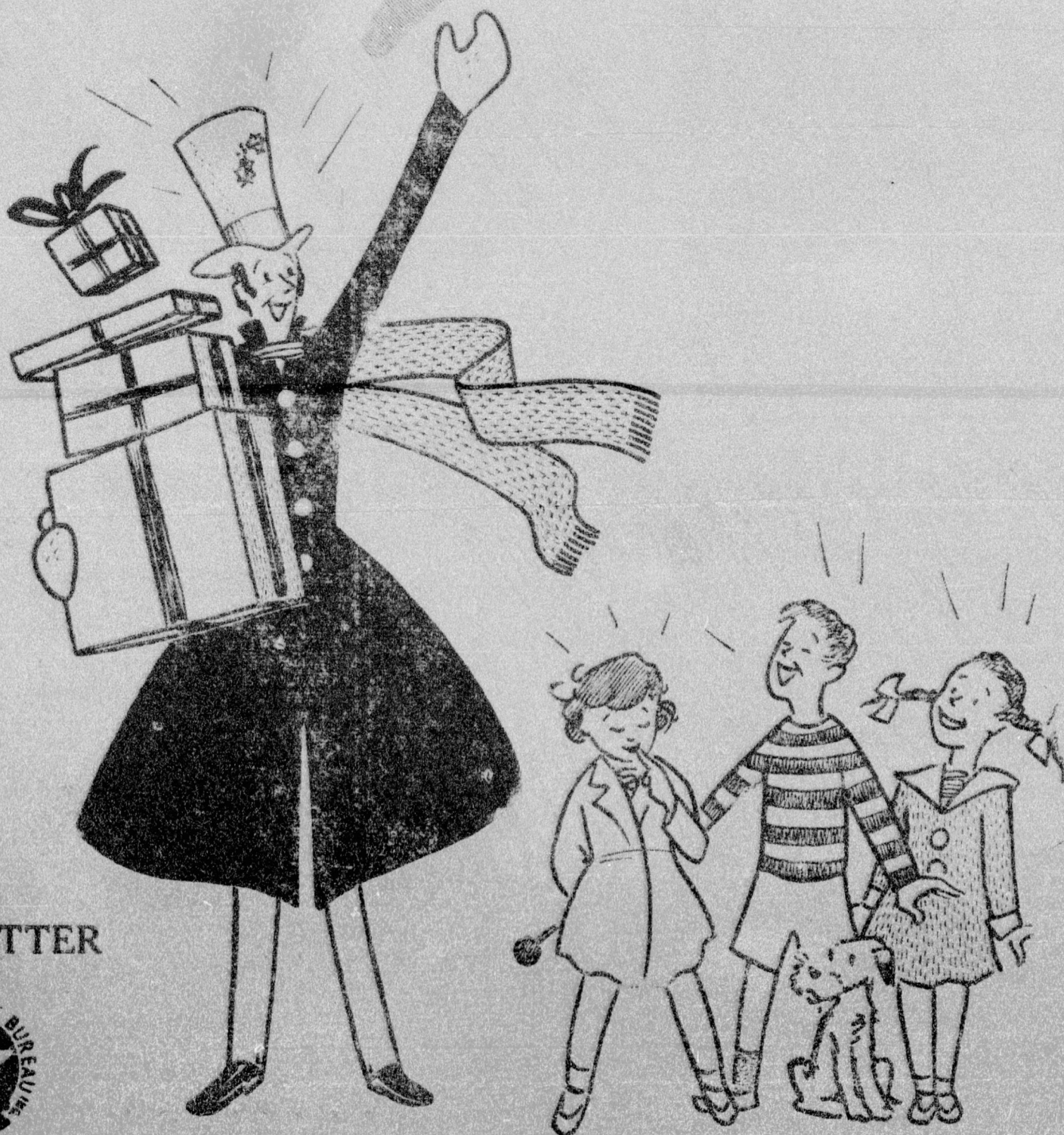
MR. GIFT GETTER

— A family affair for every Carolinian! Presented by your Friendly Raleigh Merchants