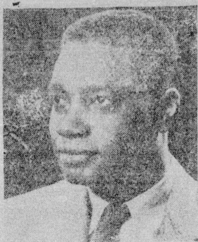
KENNETH SPENCER, bass, will appear at North Carolina College in the lyric series on February 1. Spencer, known for his appearances in "Show Boat" and other such famed presentations, will appear in the E. N. Duke Auditorium at the Durham institution. His concert is scheduled to begin at 8:15 p. m.

—The Concert Committee of North Carolina College announced that the date for concert by Kenneth Spencer has been changed to Feb. 5 and will be presented in the Duke Auditorium at 8:15 p. m.