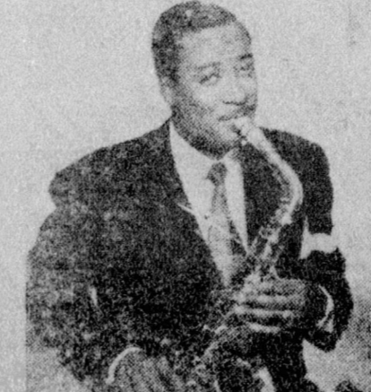
PAUL WILLIAMS Joe Thomas, with Ed Wilcox's Lunceford Orchestra, has added his new torch-like tunes to a musical vanguard more Kenton than Lunceford, while Paul Williams, bottom right, had made innovations on the music scene that are amazing.