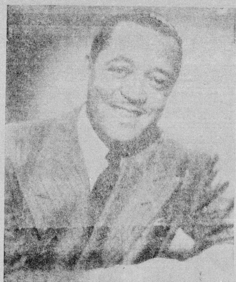
AN EYE FOR AN EYE may be "real gone" in some modes of thought, but to sax-playing Lester Young, it's all so much eye-wash. Maestro Young recently nearly lost the sight of one eye when a careless smoker dropped a burning cigarette from a New York apartment window. Young luckily received treatment in time to prevent such a disaster and now back in his old haunts "sendin'" his listeners.