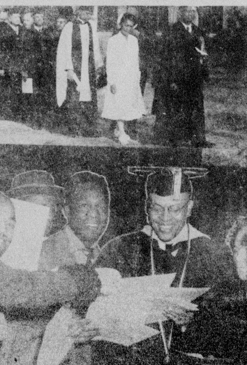
At the upper right members of the inaugural procession who were scheduled to be seated on the speakers' platform are shown as they marched across the campus to the strains of Mendelssohn's "War March of the Priests" from "Athalia".