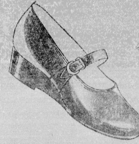
Black, Red and Green Calf $6.95