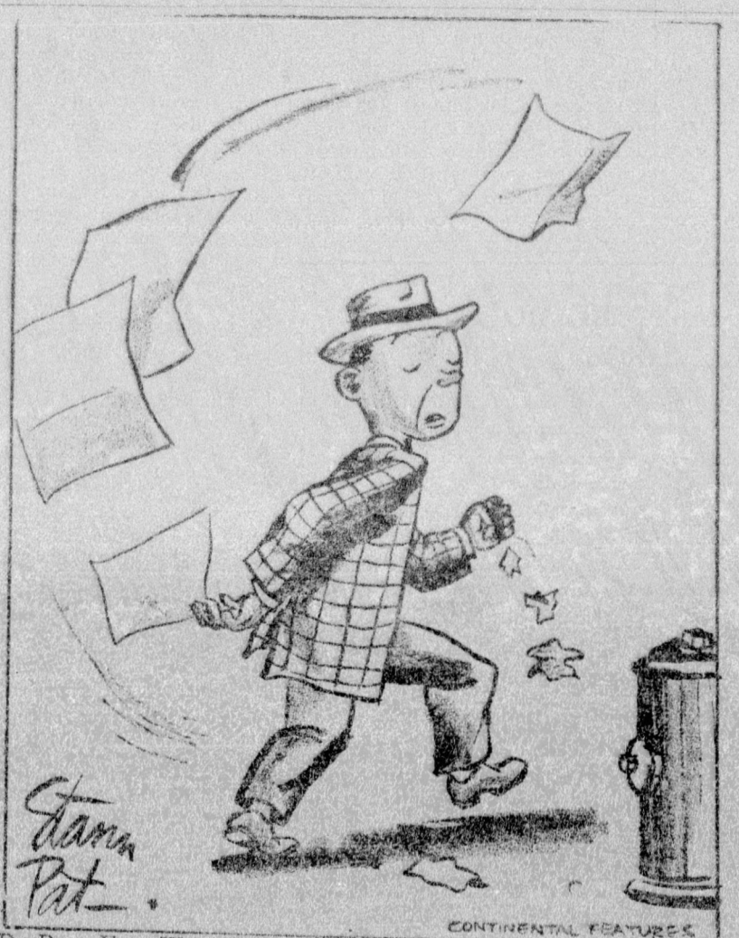
Do Drop Your Waste in the Receptacles Provided for this Purpose

State College Answers Are any tobacco seed of the Bottom Special variety certified in North Carolina?