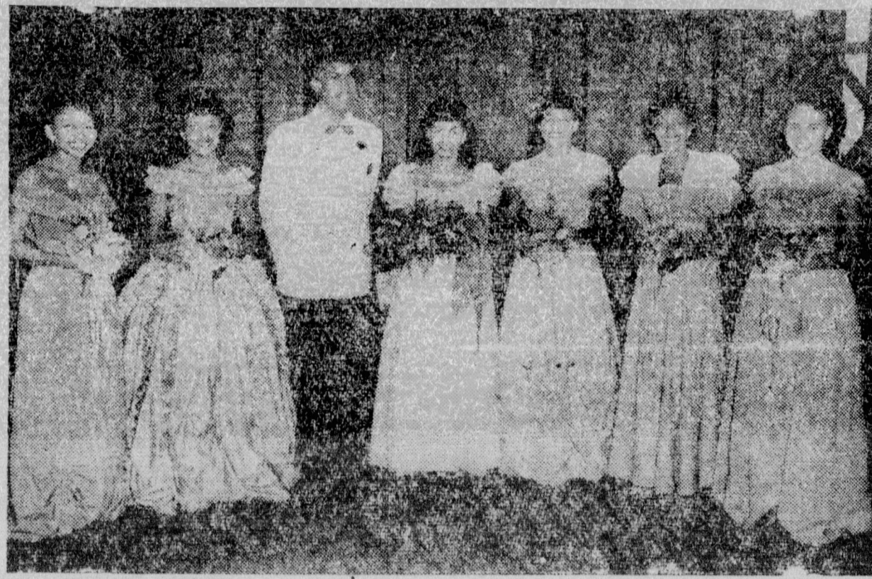
PRESENT MAY FESTIVAL AT SHAW — The Shaw University Physical Education department presented its annual May Festival Saturday afternoon May 14.

EXELENTO MEDICINE COMPANY, Atlanta, Georgia