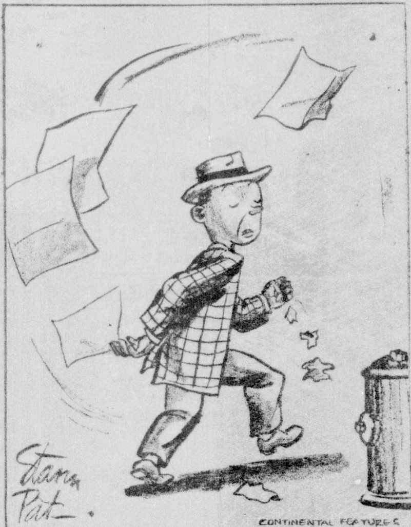
CONTINENTAL FEATURE 6