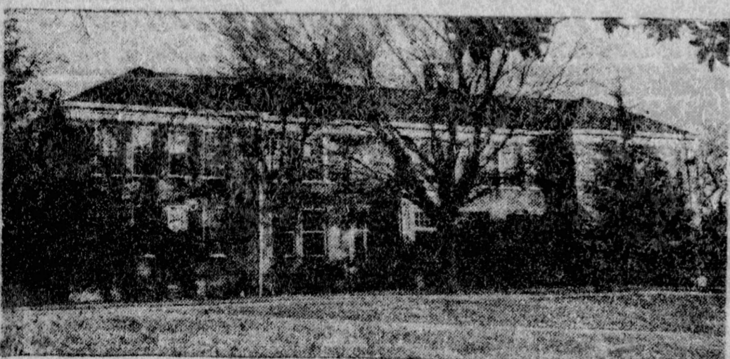
NEW BENSON LIBRARY