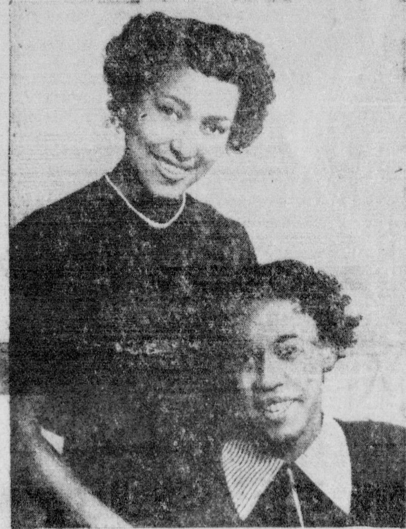
RETURN HOME — These two attractive misses have every reason to smile amiably for they have just returned from a much treasured trip to Stockholm, Sweden, where they attended the Third World Congress of Bap-