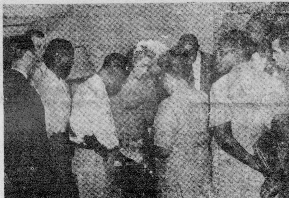
AS CITIZENS DISCUSSED PROJECT — Raleigh's housing controversy, centering about plans for construction of a low rent apartment-type housing project in the Longview Park area was under discussion at the above picture was made at the Bloodworth Street Y.M.C.A. Tuesday night during a joint meeting of the Raleigh Civic Association with Longview residents. (Story on this page)