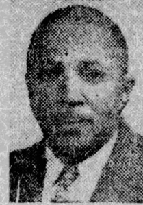
"A Civil Rights Law Will Give These Words A Meaning"

"GIVE ME YOUR TIRED, YOUR POOR, YOUR HUNGERED MASSES YEARNING TO BREATHE FREE, THE WRETCHED REFUSE OF YOUR TEEMING SHORE. SEND THESE, THE HOMELESS, TEMPEST-TOST TO ME, I LIFT MY LAMP BESIDE THE GOLDEN GATE!"