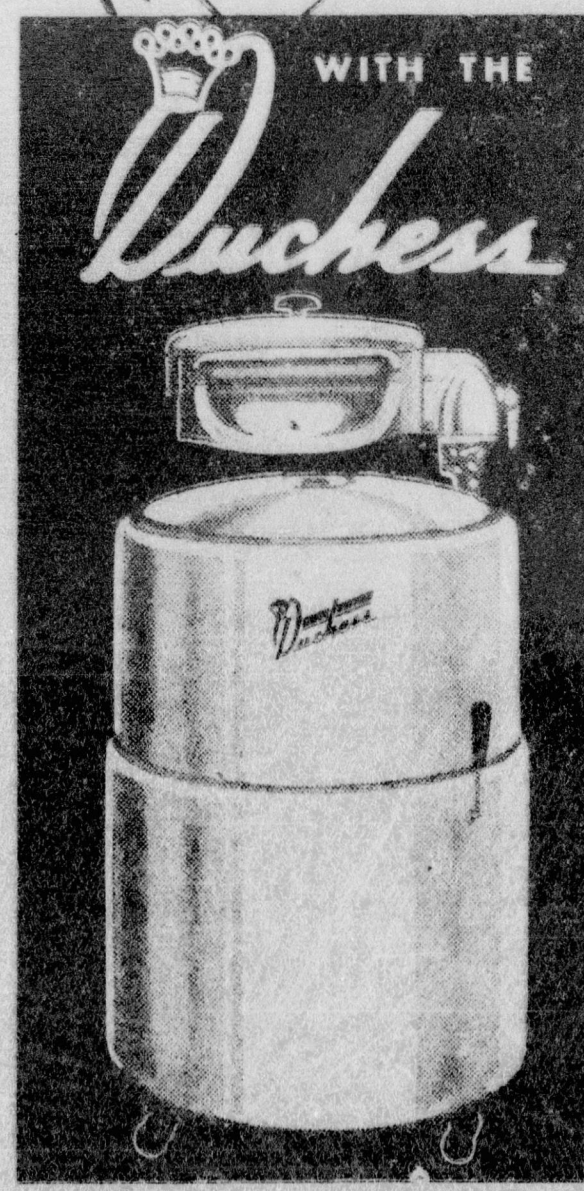
So Good It's Guaranteed for Life . . .

The big, beautiful Duchess is quality built by the world's largest manufacturer specializing in wringer type washers. No washer is bigger - none better - at eny price. Gustantend for LIFE. Como in - today -- our allotment is limited.