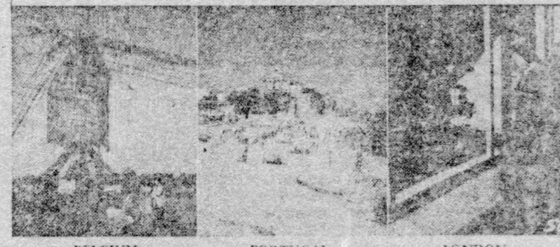
BELGIUM PORTUGAL LONDON

It's bargain time for the traveller! If you've ever had a desire to tour Europe and hadn't the time or the money, this is the time to start making plans.