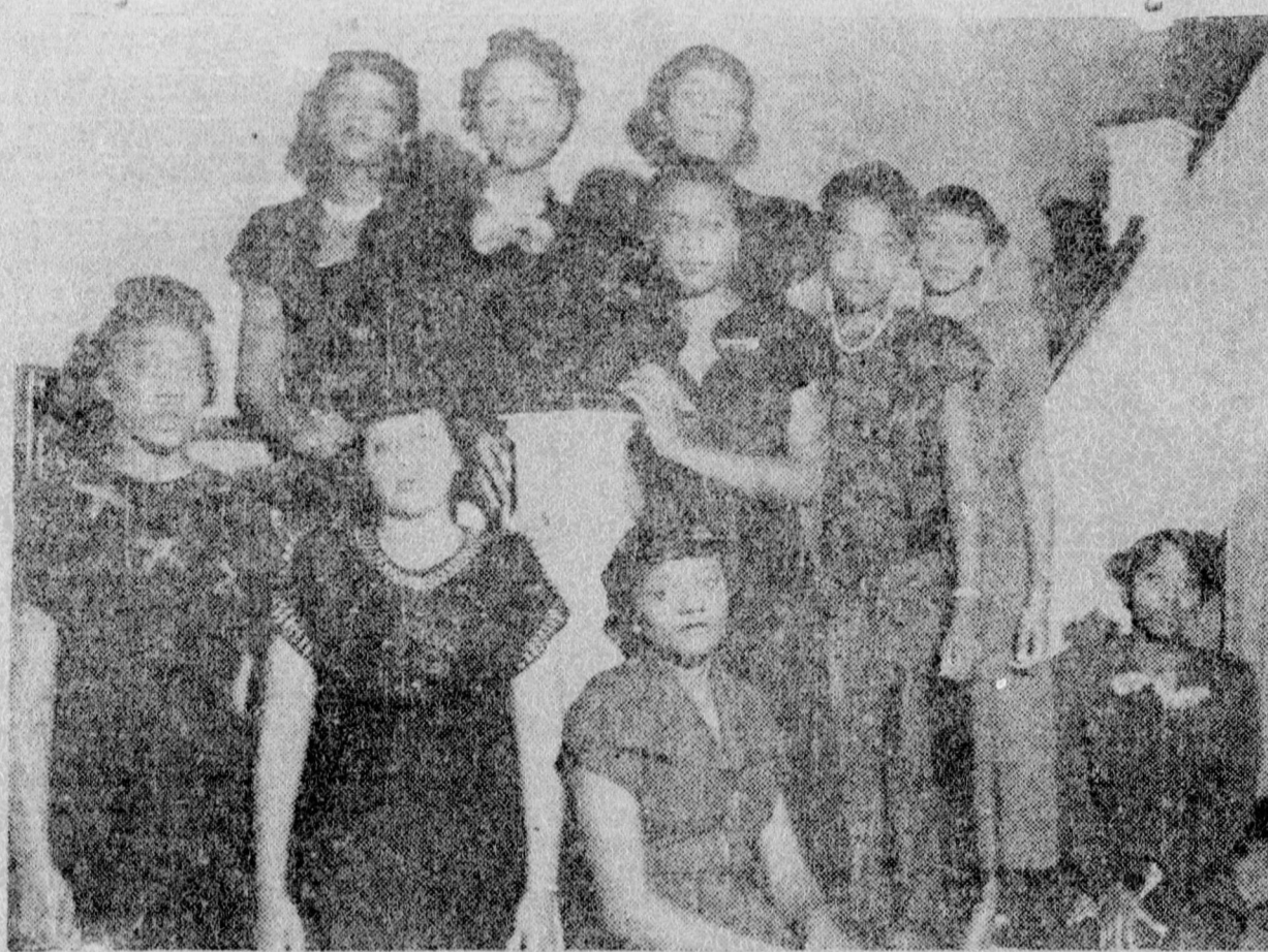
IN POPULARITY CONTEST— Pictured above are the contestants taking part in the Popularity contest sponsored by the Junior Woman's Club. The winner will

Other EXELENTO Beauty Aids: • Goggles and Pressing Oil • Ex-Odor, a dainty deodorant • Bleach Cream, for brighter skin