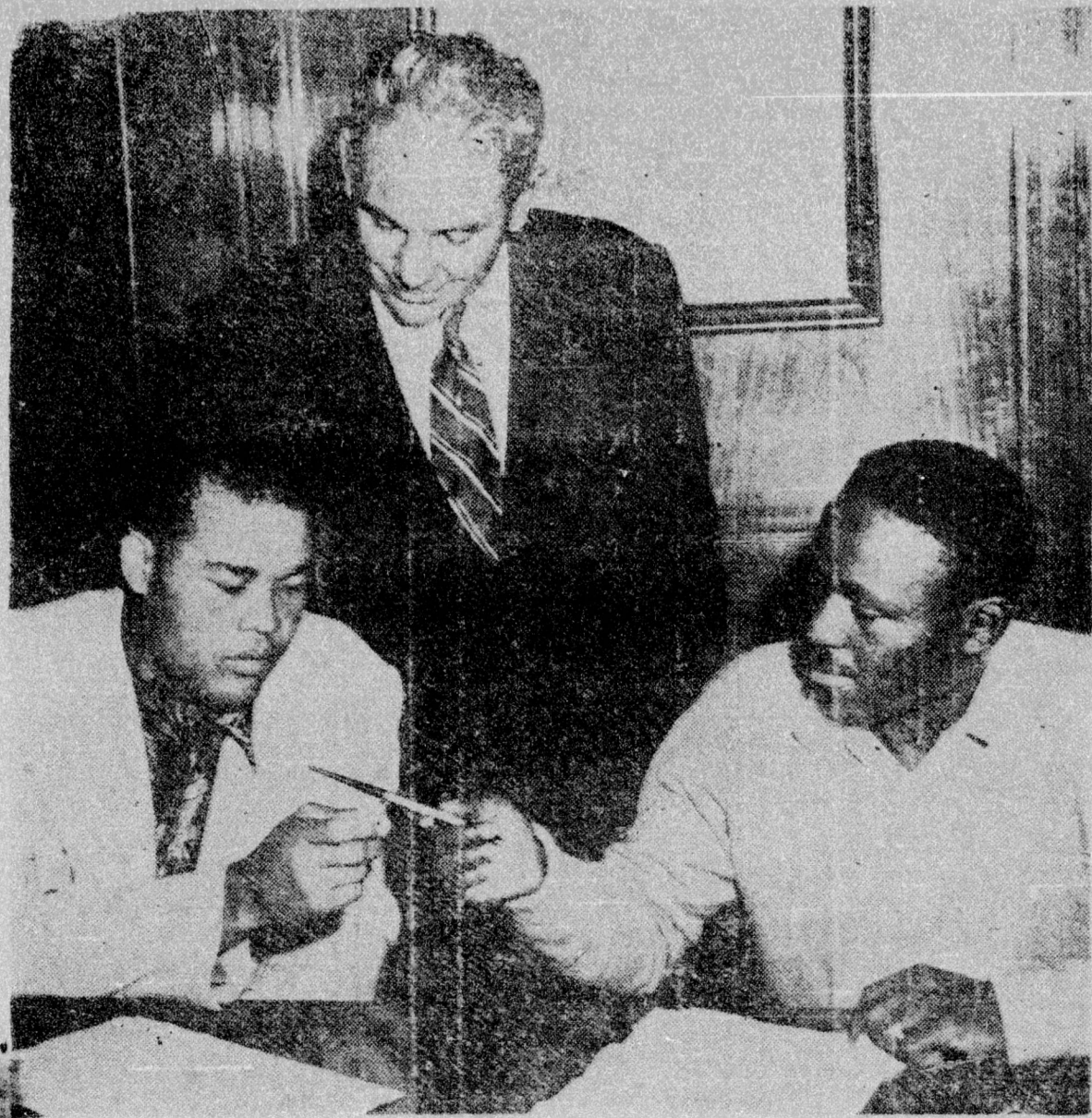
BOTH SIDES AGREE: Joe Louis, who came out of retirement, takes the pen from NBA heavyweight champion Ezzard Charles, at the offices of the New York State Athletic Commission to sign for the world-heavyweight title match in Yankee Stadium, September 27th. Looking on is Commissioner Eddie Egan.