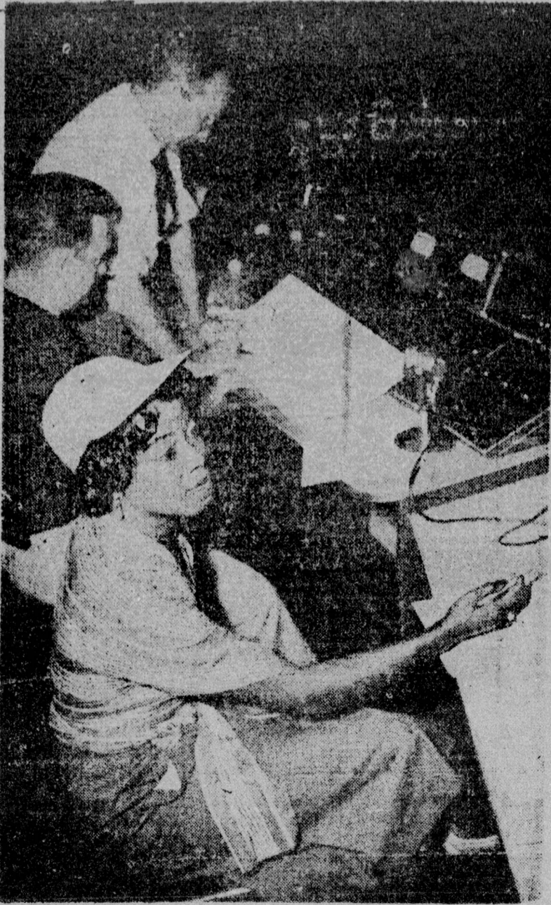
A SESSION WITH SARAH —Sarah Vaughn is shown in the central booth of the Columbia recording studios in Hollywood as she listens to the playback of a new waxing she has just cut. Also lending an attentive ear to the Vaughn vocal magic is Maestro Paul Weston, who penned the arrangement and conducted the orchestra for Sarah's disc date.