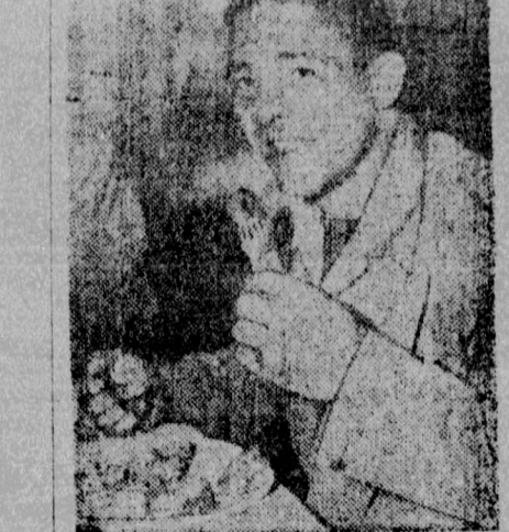
NEW CHAMP — Enjoying a hearty breakfast at a London hotel, Randolph Turpin, new middleweight champ of the world confidently assures his supporters that he can defeat sugar Ray Robinson again, if they are rematched in the U. S.