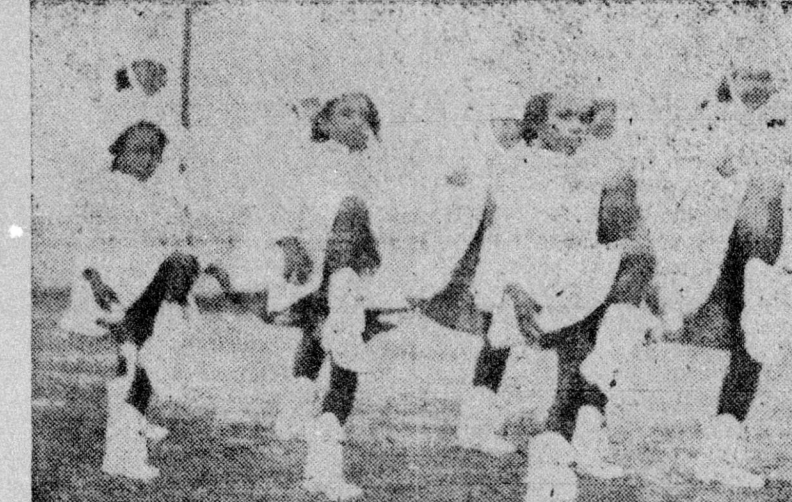
STRIKE UP THE BAND - Junior majorettes of the Williston high school band line up for a swing down the main street of Wilmington for Williston's annual home-coming parade which this year drew much applause.