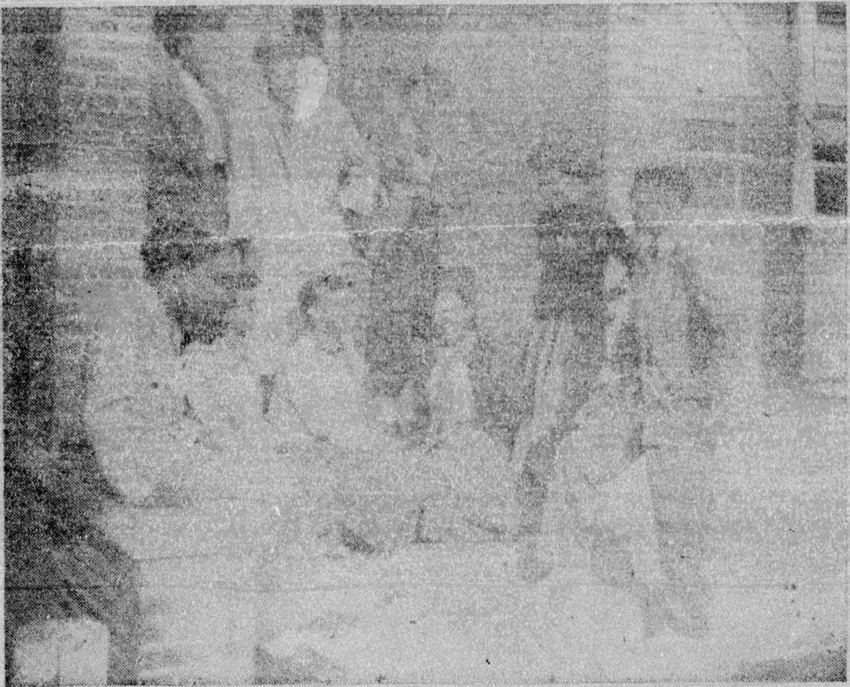
MISSING DOG PLAYS - This smiling group of young boys, members of the newly organized business boys club at Artesia high school, Baltimore, N. C. Left to right, they are...