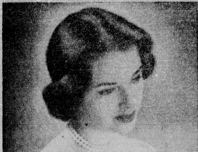
Leading models have glamorous hair men adore