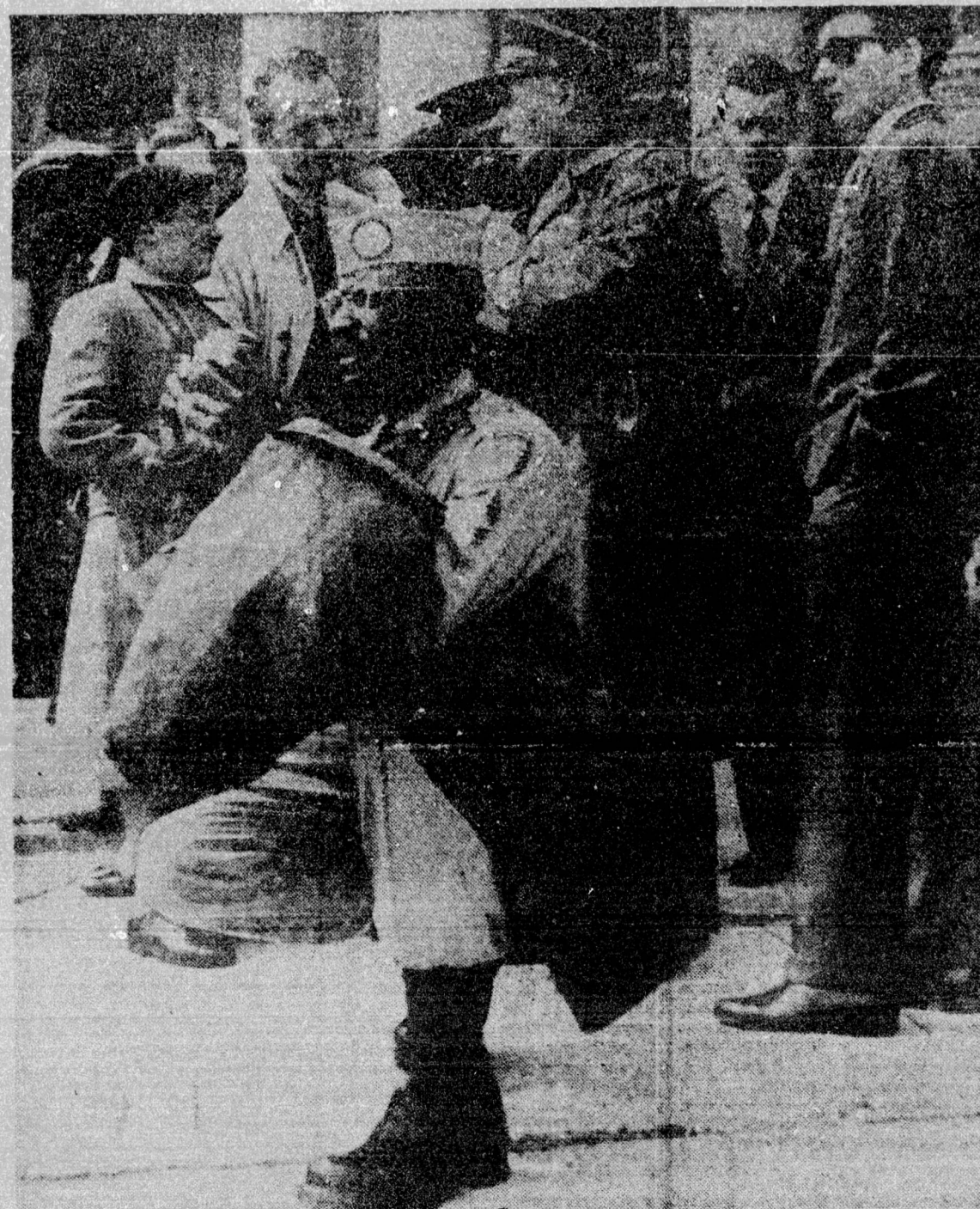
RECEIVES POPE'S BLESSINGS — Catholics from all over the world recently gathered at St. Peter's, Rome, to receive the first blessing of Pope Pius XII since he was stricken by illness. An American GI was among the thousands who heard the Catholic church head pray for banishment of atomic, biological and chemical weapons, excepting for defense.

Your Vote and Active Support Will Be Appreciated