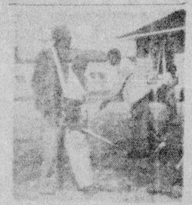
BEAUTIFICATION of home and community play a big part in the community. How to beautify the lawns by shrubbery, grass and flowers is taught. The group is shown in the yard of Shawtown school.

Home beautification of home and community play a big part in the community. How to beautify the lawns by shrubbery, grass and flowers is taught. The group is shown in the yard of Shawtown school.