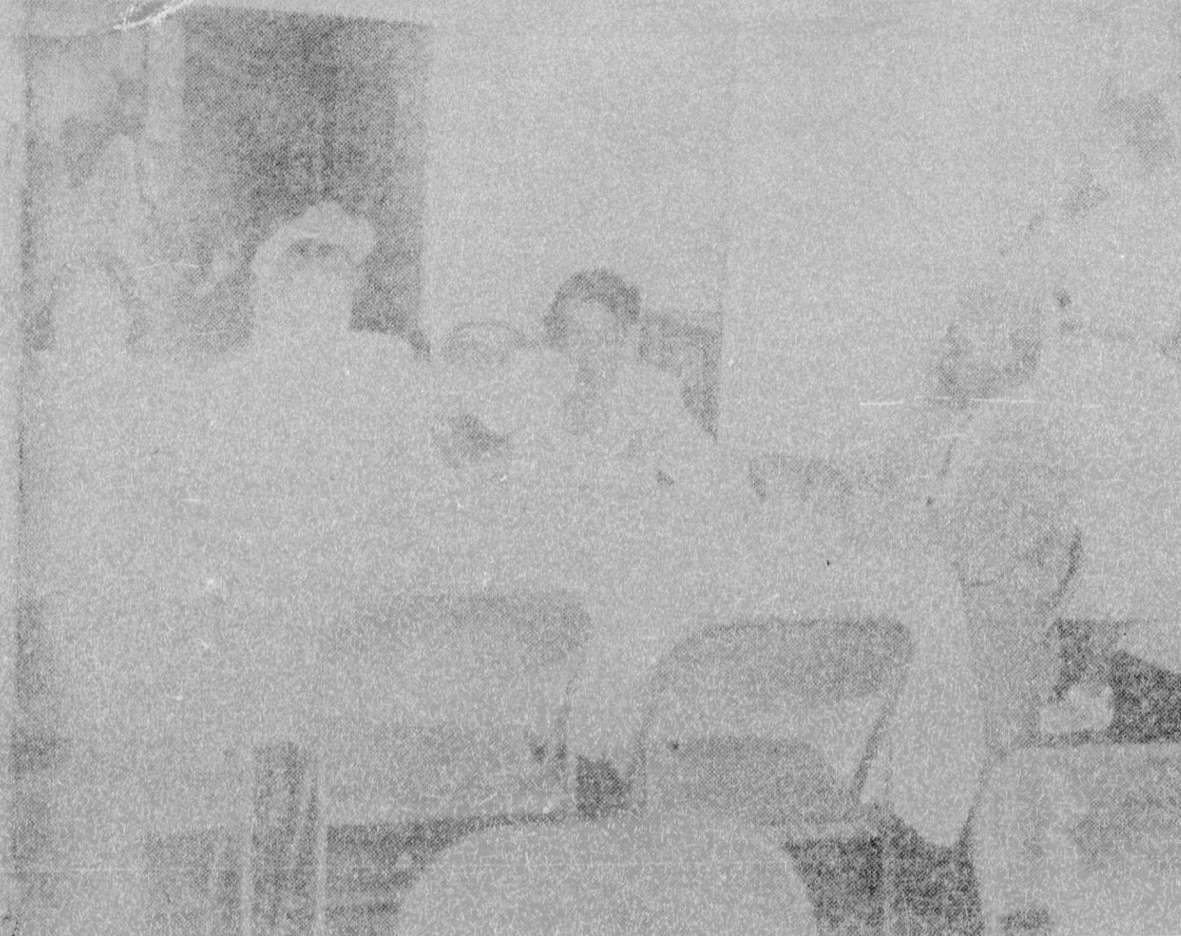
DELEGATES DINE — Early arrivals at the Raleigh Elks Home for the state convention held here this week beginning Sunday and ending Thursday of this week, are shown above enjoying a meal.