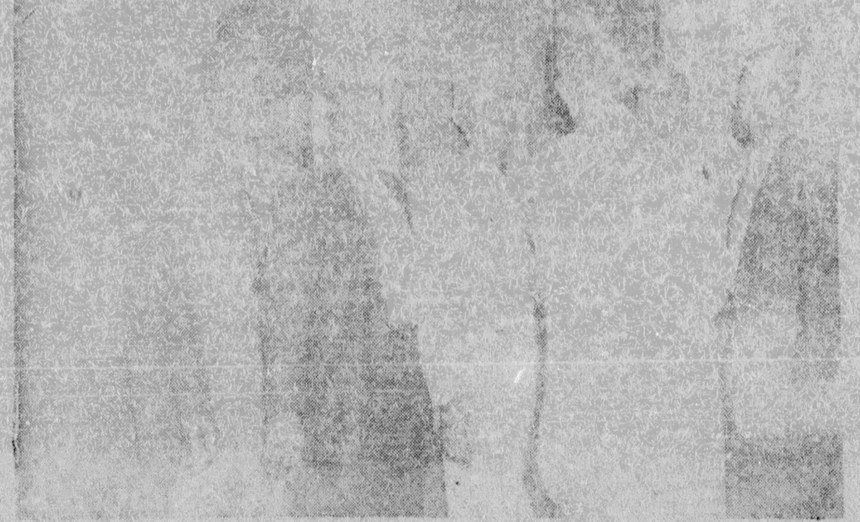
SINGING AT MEMORIAL AUDITORIUM — Several local Elks are shown here waiting their turn to enter the Raleigh Memorial Auditorium last Sunday morning to attend the Song highlights of the 35th Annual Festival, which was one of the convention.