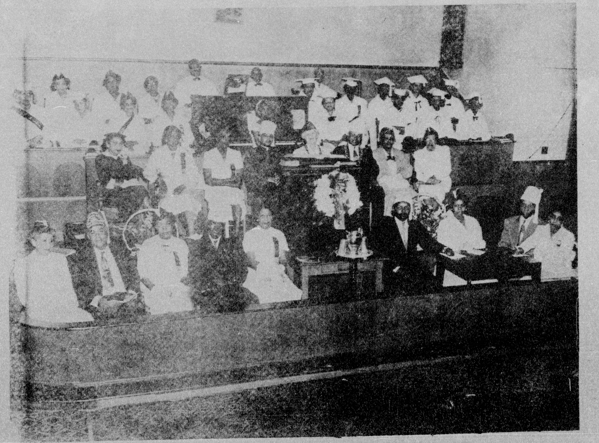
MEMORIAL SERVICE — A memorial service was staged here by Elk officials and delegates Sunday, launching the 35th Annual Convention. Several state officers and delegates took active parts in the affair.