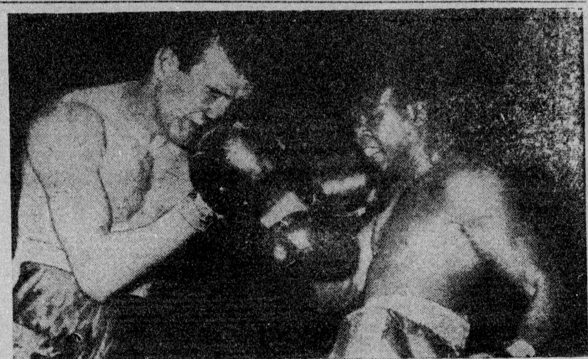
SWEET REVENGE —Former lightweight king Kid Gavilan, ducks away from a left thrown by England's Peter Waterman in a recent return match at Earl's Court. Gavilan gained "revenge" when he took a 10-round decision over the young Britisher. When they met in February, Waterman won a highly-disputed decision.