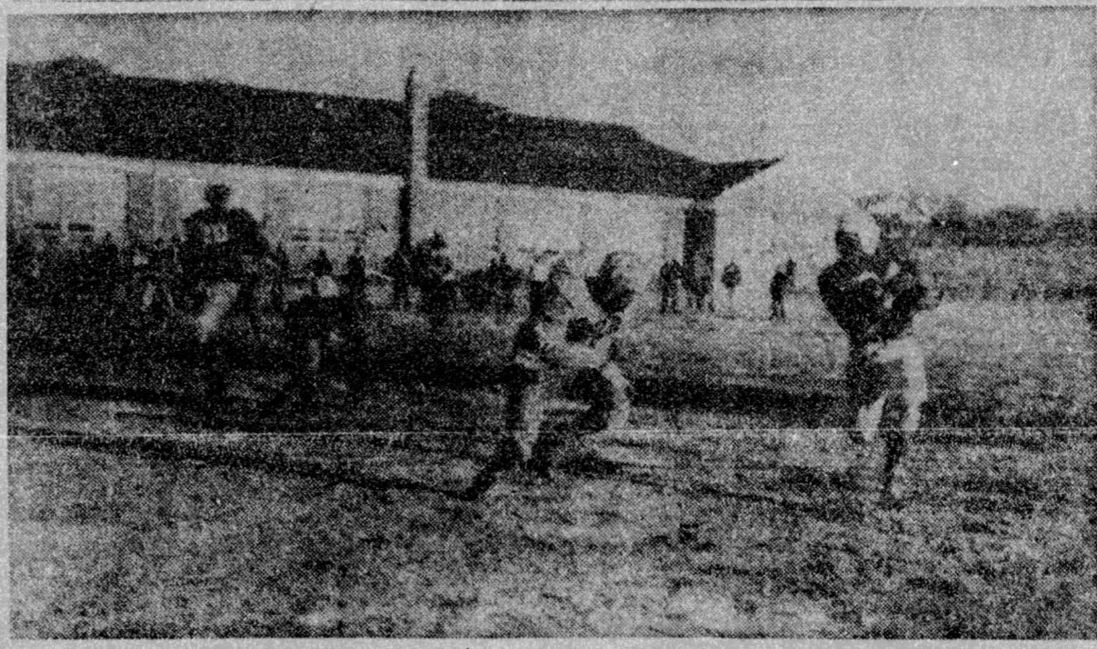
Berkley Defense Clicks — West Southern Pines player (right) just before being forced out of bounds while attempting

a punt return during Friday's decisive game in Eastern District 6-man high school football competition. The host team, Berkley High of Aberdeen, won 30-17, thereby clinching district title and a chance at state 6-man championship.