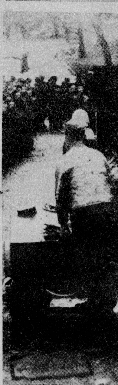
FIRST HOT MEAL — Hungarian refugees line up in front of a field kitchen of the Austrian Army at Eisenstadt, Austria, to receive their first hot meal since their escape from their Soviet-dominated homeland.