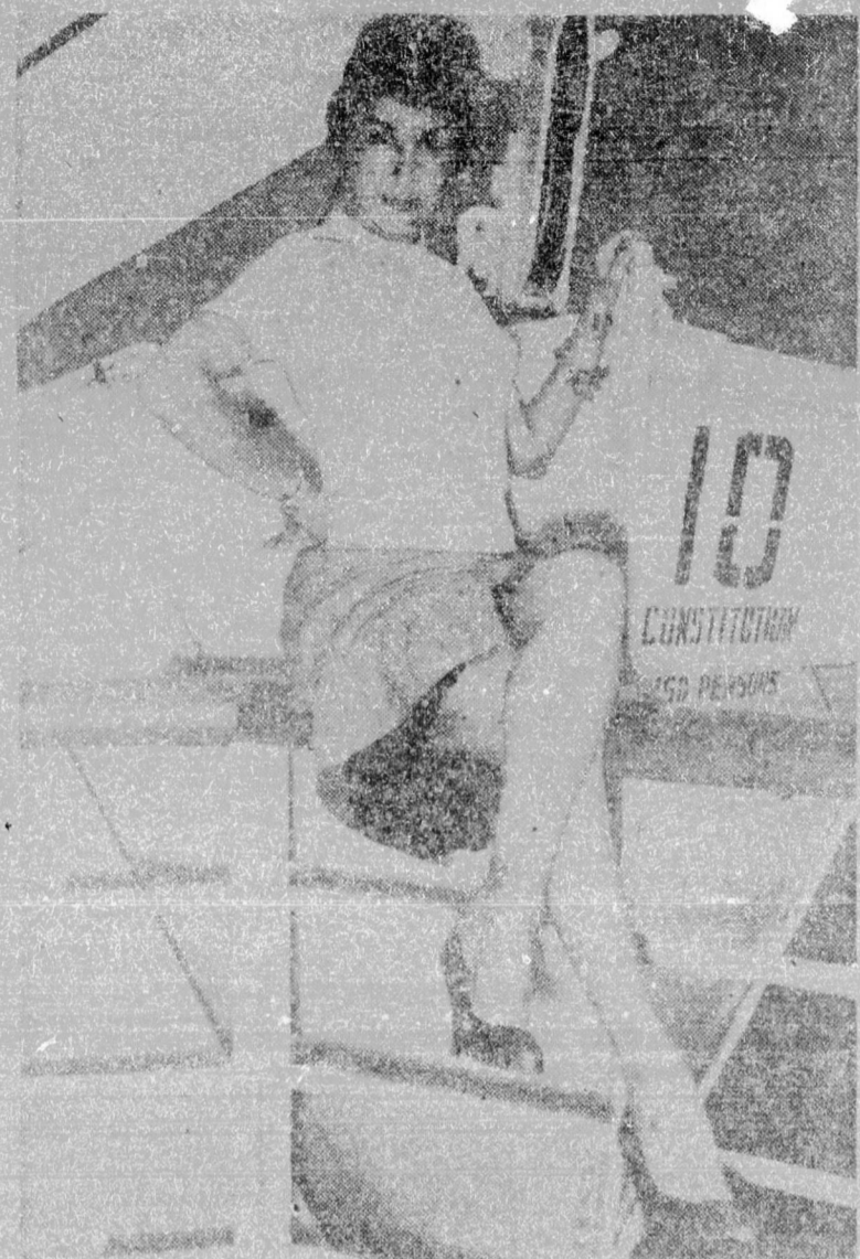
NEW MRS. BELAFONTE — Irish-Indian dancer Julie Robinson daughter of a wealthy California plastic manufacturer, was revealed last week as the secret bride of folk singer, Harry Belafonte. The pair were married in Mexico on March 8, less than two weeks after Belafonte's first wife received a Nevada divorce. The new Mrs. Belafonte was once a member of the Katherine Dunham dance troupe.