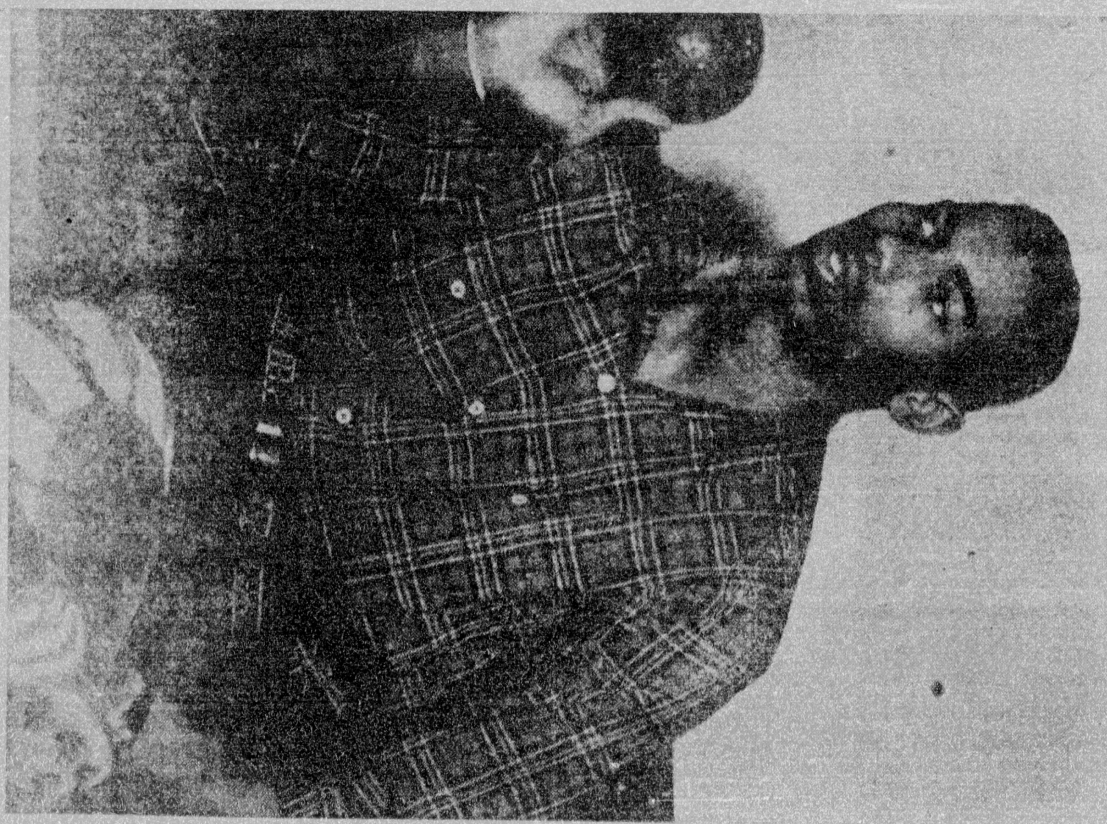
TALL AND TALENTED — With "The Star" Chamberlain, Kansas University's 7-foot All-American basketball ace, hettis the shot April 11th, as he prepares for his varsity track debut against Oklahoma A. & M. in Stillwater, Oklahoma, April 12th. Chamberlain tossed the shot nearly 48 feet as a freshman last year and also showed promise in the high jump with a leap of 6 feet, 4 and seven eighths inches.