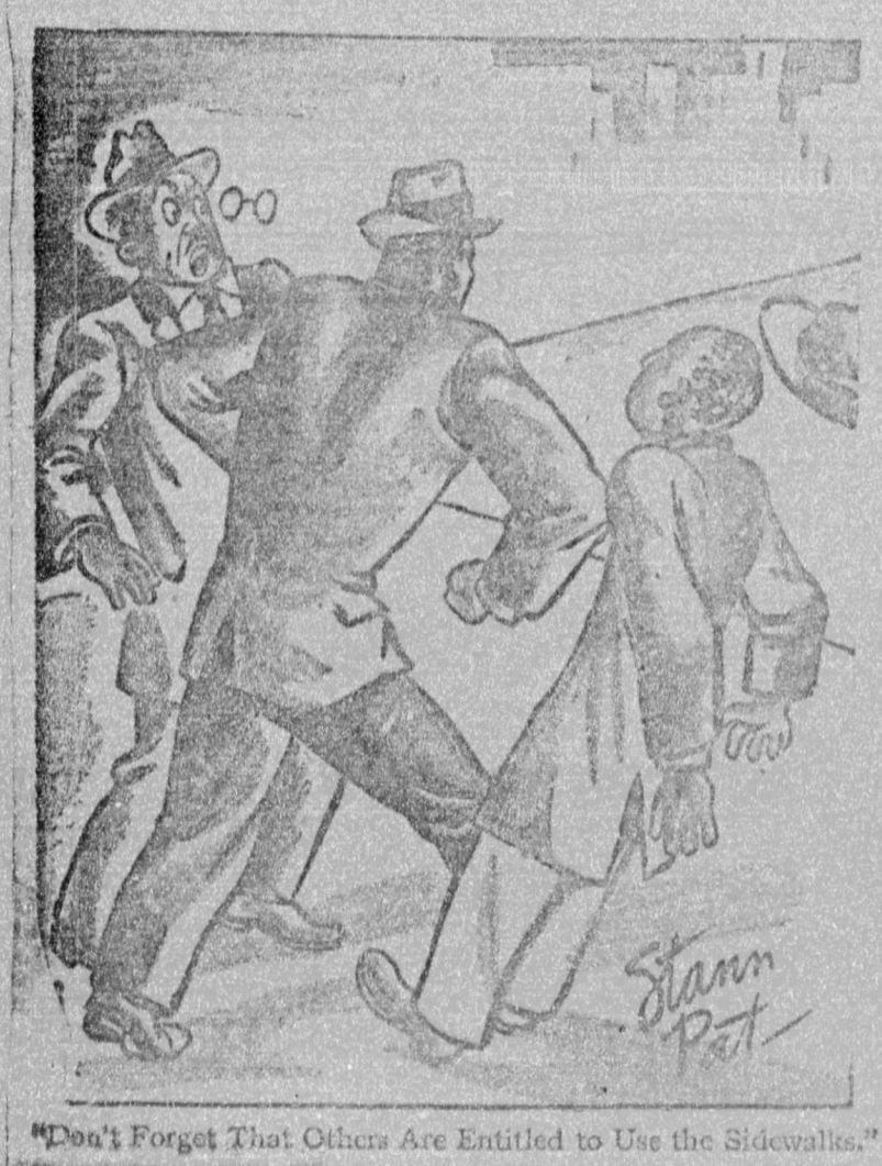
"Don't Forget That Others Are Entitled to Use the Sidewalks."