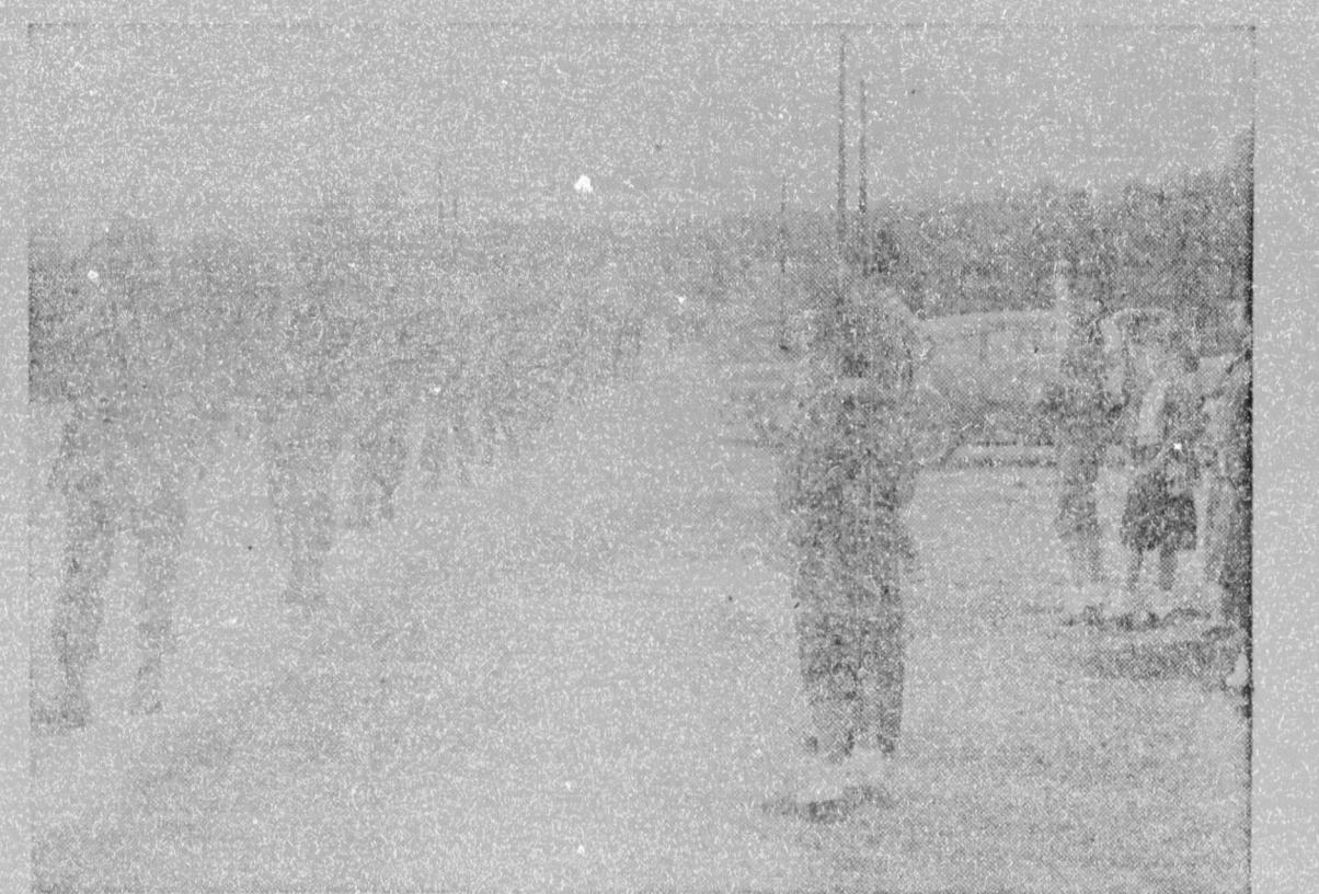
MARCHING THROUGH TENNESSEE — The unusual sight of 175 soldiers on a five-day hike across a group of soldiers. These marauders of the 101st Airborne Division at Fort Campbell, Ky., ended the 34 mile back-country march with a parachute drop out of Stewart Air Force Base.