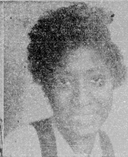
of the Florida Association of the New Homemakers of America held recently at Florida A and M University. They are (from