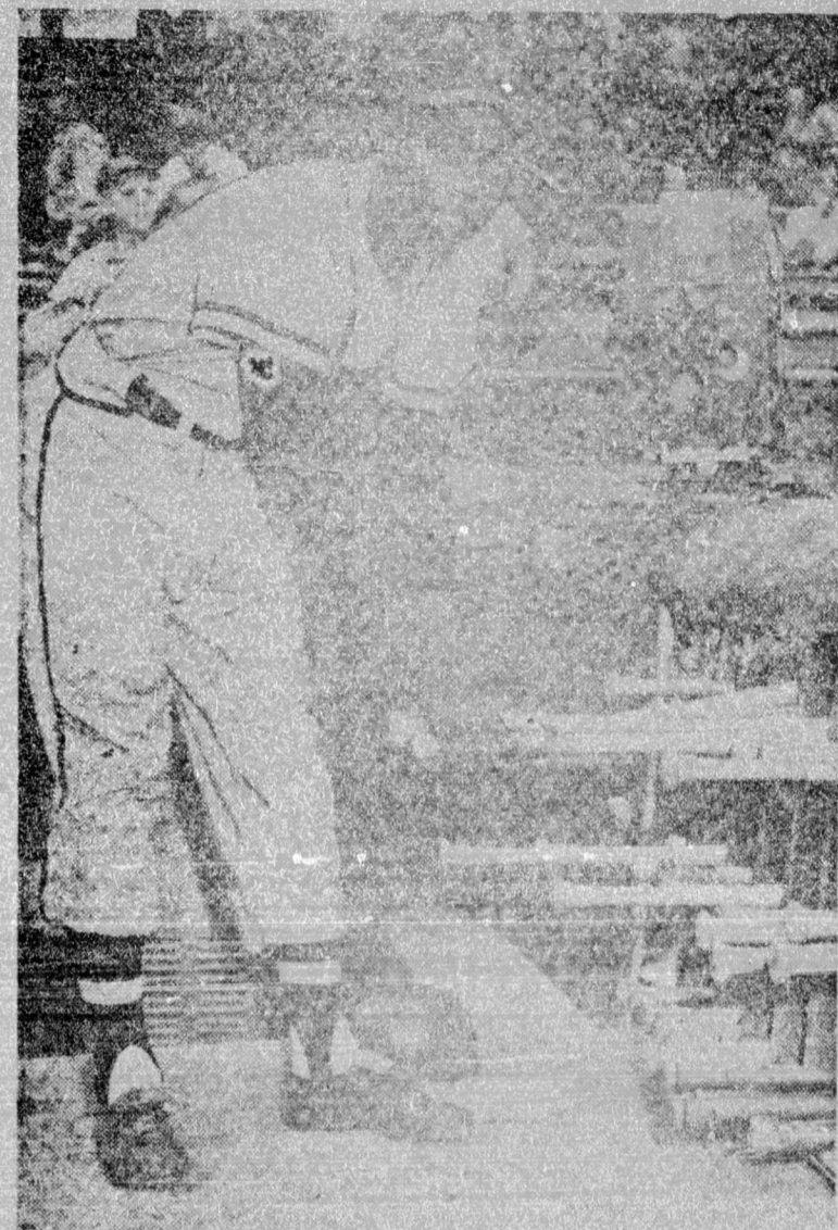
HEAP BIG BRAVE — Milwaukee Brave outfielder, Hank Aaron, selects his favorite way club from the bat rack before the home-opener. Aaron, who burned up the Citrus Great with a 400-plus hitting average, is expected to be a front runner in the race for 1957 batting honors in the National League.