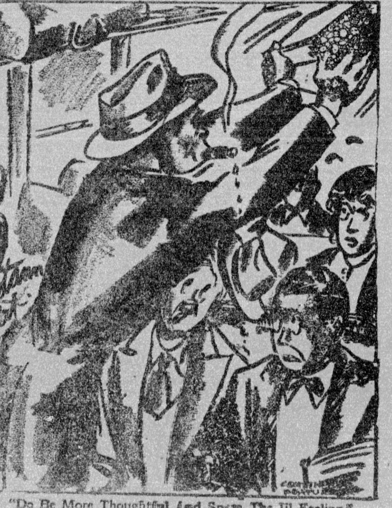
"Do Be More Thoughtful And Spare The Ill Feeling."