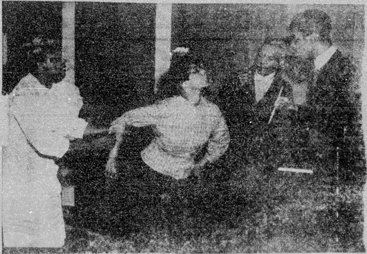
"PYGMALION" — When the Intercollegiate Drama Association held its annual Arts Festival at A&T College recently, these players from North Caro-