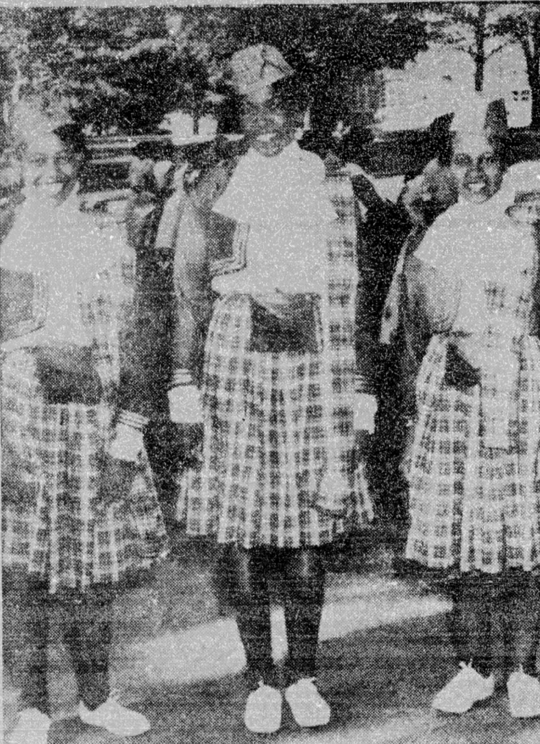
THREE "HIGHLANDERS" AT ST. AUGUSTINE'S COLLEGE

Make your child independent. The family has a fine opportunity