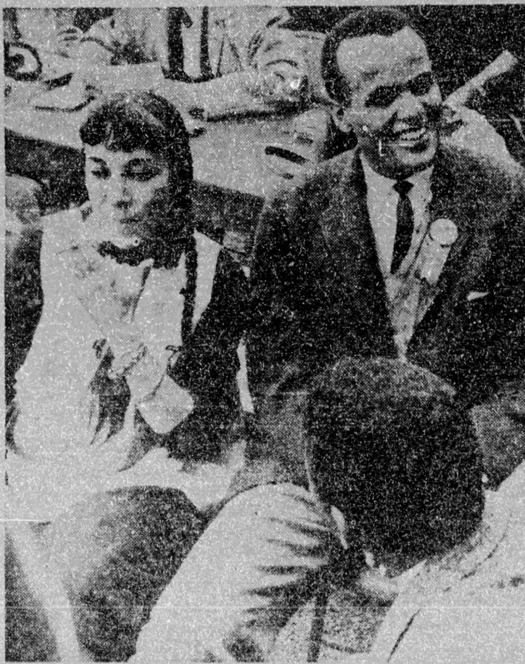
JOINED THE PILGRIMS — Singer Harry Belafonte greets friends, while his pregnant wife, Julie, relaxes on the steps of the Lincoln Memorial during the Prayer Pilgrimage to Washington. Belafonte was among the score of celebrities who made the trip for the historic traveler meeting.