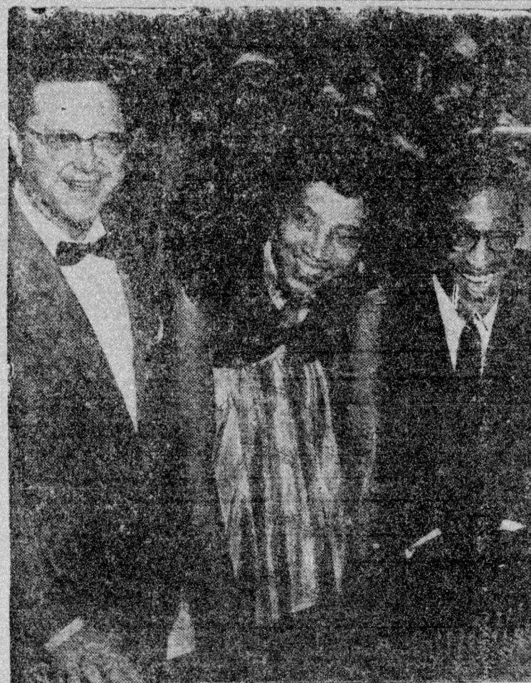
CLOSE HARMONY — Television comedian Sam Levenson (left) and variety entertainer Sammy Davis Jr. flank tennis queen Althea Gibson, during a recent affair of the Negro Relief Committee at Birdland in New York. Miss Gibson left immediately afterwards for an overseas tour.