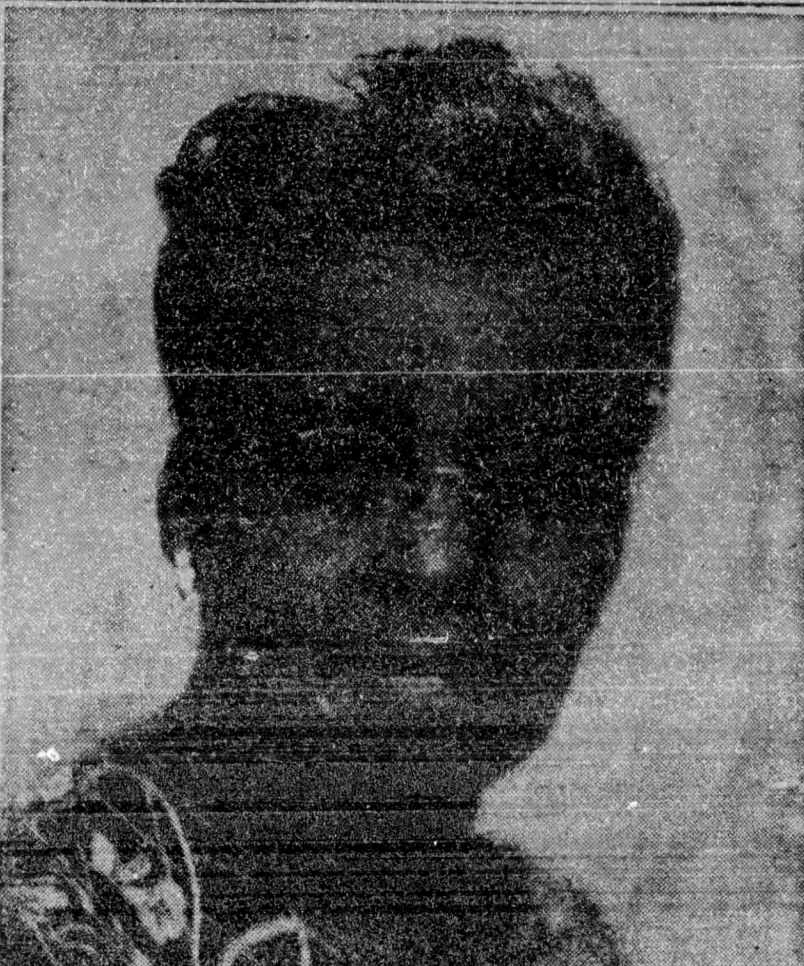
Portrait of a man in a suit, likely a graduate or official mentioned in the text.