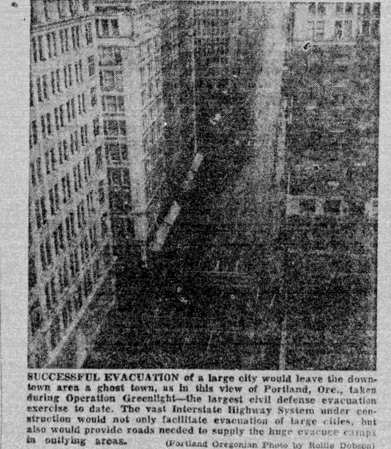
SUCCESSFUL EVACUATION of a large city would leave the downtown area a ghost town, as in this view of Portland, Ore., taken during Operation Greenlight—the largest civil defense evacuation exercise to date. The vast Interstate Highway System under construction would not only facilitate evacuation of large cities, but also would provide roads needed to supply the huge evacuee camps in outlying areas.