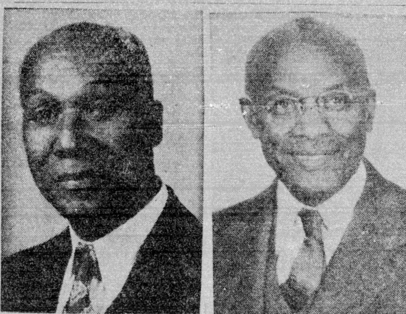
Portrait of a man in a suit, likely a graduate or official mentioned in the text.