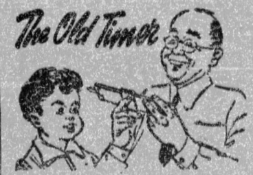
"Of all human inventions, the most worthless is an excuse!"