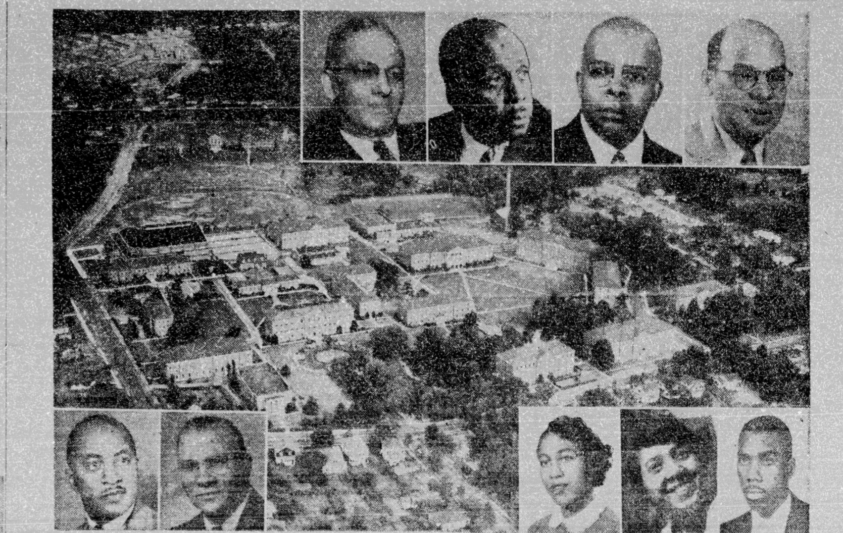
PRINCIPALS IN NCC'S 46TH "FINALS" EXERCISES —Super-imposed over an aerial view of North Carolina College's campus are the principals in 46th "finals" exercises concluded in Durham Tuesday.