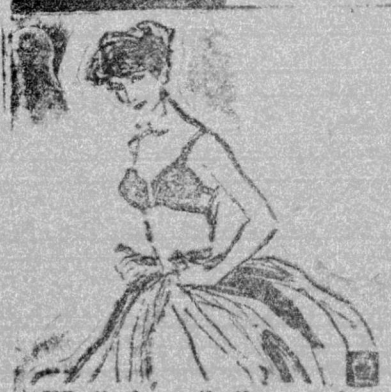
Figure Fashions by Peter White

What's beneath the new bare back and plunging neckline fashions? Formfit's new "Holiday" bra of nylon lace, which does the trick with cleverly placed elastic straps and padded wire. It comes in white or black. There is a contoured version in white only.