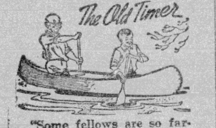
"Some fellows are so farsighted that they rest before they get tired!"

Blanket Specials 2-Weeks — July 15th Through July 27th Pick Up and Delivery Service APEX CLEANING COMPANY APEX, N. C. It Makes Us Happy To Serve You!