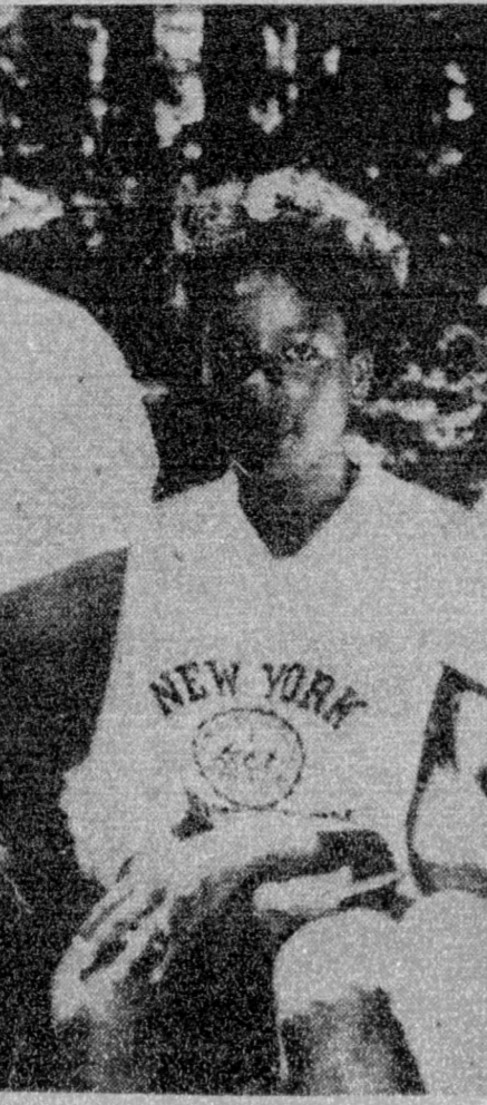
Most of the students were physical education specialists or sports directors in high schools and colleges. Forty-six courses were offered in the camp. Subjects ranged from basic teaching techniques to modern and folk dance instruction.