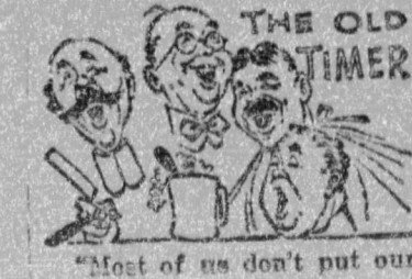
THE OLD TIMER "Most of us don't put our best foot forward until we get the other one in hot water!"

Then said Jesus, Father, forgive them; for they know not what they do... (St. Luke 23, 34.)