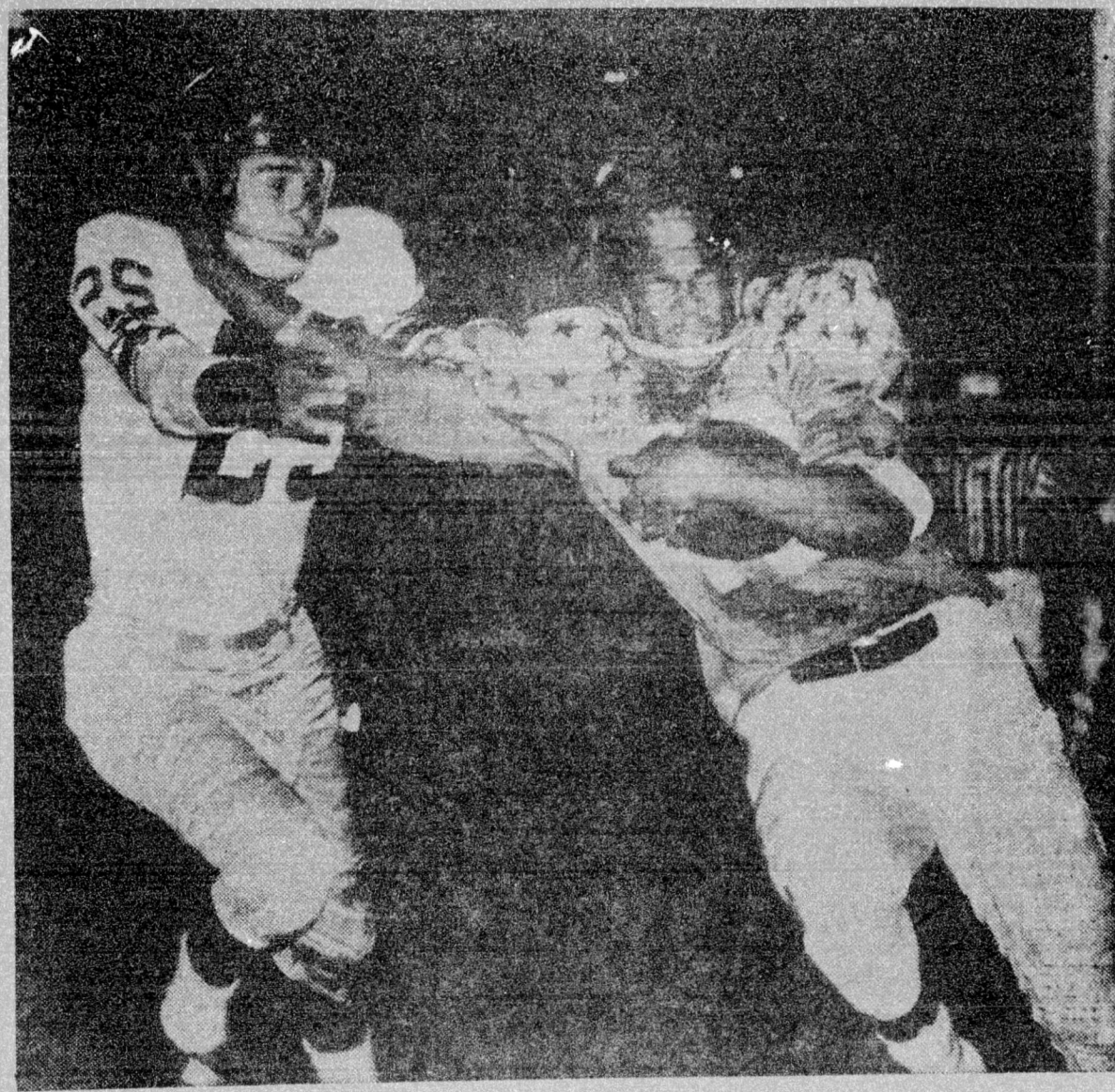
STOPPED SHORT — All-Star back Abe Woodson (right) tries to fend off giant Defender Dick Nolan, but is brought down for no gain in the first quarter of the Giants-College All-Star game in Chicago. Giants won, 22-12.